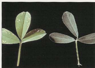
Lower leaves of deficient plants are edged with white spots (left).