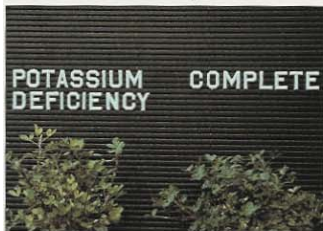
Leaves of severely deficient plants turn completely yellow.