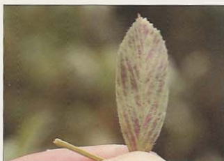
Yellow coloring turns reddish to purplish between veins.