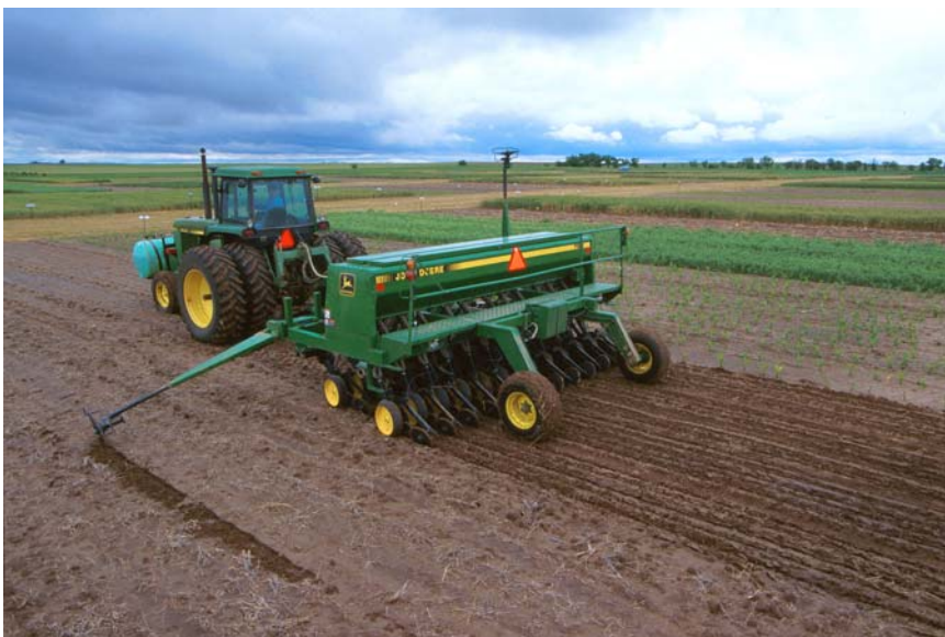
Careful planning and preparation of land for planting alfalfa this fall will help you manage the field for the rest of its life span.

Statewide. One of the easiest ways to simplify your alfalfa operation is to plant quality seed that is adapted to your region and use. Determining variety choice by observing those alfalfa varieties doing well in your area and yielding well and also comparing trial results can really pay off in the long run. Utilize the alfalfa variety information through the Extension Service by either obtaining a copy from your county agricultural agent or by logging onto www.cahe.nmsu.edu and looking for the information under publications and agronomy. Even paying extra money for new, better seed pays off. For every dollar per pound of quality alfalfa seed, only a 5 percent or less yield improvement can pay for the initial input cost (this would be a 0.33 ton per acre per year yield advantage over a 6-year period for the stand). Even at $20 more per acre, quality seed can provide an average increase in net profit of over $200 per acre (double that with recent hay prices). Input costs put toward careful seed purchase is worth the cost and time it takes to get a high quality, adapted variety that is certified and assured that it is weed seed free.