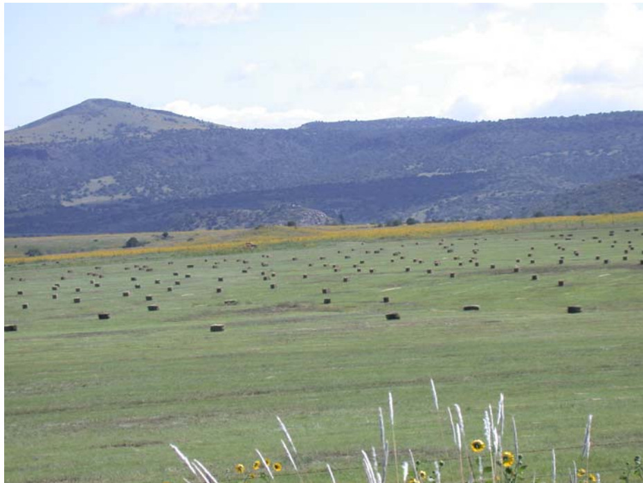
Grass and alfalfa mix can be beneficial, especially if haying as well as grazing in some higher altitude areas of the state like north of Clayton, New Mexico.

Statewide. Interseeding perennial grasses into older alfalfa stands can extend the grazing and haying potential of the field but may be more difficult to manage, particularly with weeds. Fields can be cultivated with a harrow or disk in the late winter or early spring to prepare a seedbed and after the last alfalfa cut, fall seeding of several different perennial grasses can occur. Some of the more suitable grasses for interseeding are: orchardgrass, perennial ryegrass, tall fescue, kemal festulolium (ryegrass x tall fescue), timothy or even matua prairiegrass. Orchardgrass appears to be the best option for most of New Mexico. It is high yielding, very palatable and some dairies will accept alfalfa-orchardgrass for hay (but check first) and many retail feed stores will carry this hay for pleasure horses. Tall fescue is a more aggressive grass but will, eventually choke out alfalfa and possibly even other grasses utilized in any interseeding project. Ryegrass, too, is very competitive with alfalfa although it is very high yielding for the first cutting in the spring. Matua prairiegrass and timothy are both much less competitive. Forage yields are also less. However, alfalfa-