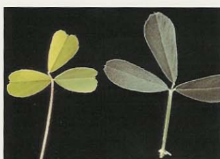
Leaves turn light green (left). Symptoms are similar to nitrogen deficiency.