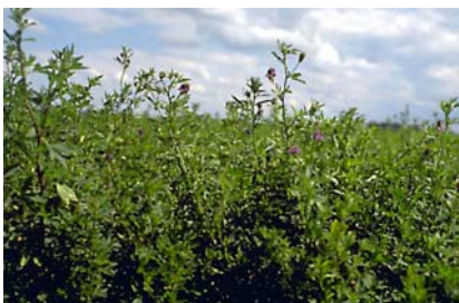
Sometimes, it is better to start a completely new stand of alfalfa.

Statewide. Many wish to thicken an old alfalfa stand by overseeding with additional alfalfa seed; however, this may not be the best management strategy. Successful overseeding with alfalfa is very difficult. Even with moisture, seedling emergence following overseeding may be excellent but often seedlings fail to survive—resulting in a final stand that is again very similar to the original, old stand. There are several reasons why overseeding alfalfa with alfalfa may not succeed. Disease, insect pests, weeds as well as nematodes often flourish more easily in established stands and find newly planted alfalfa even easier prey. Also, alfalfa seedlings grow slowly and are not very competitive early in establishment—particularly against already established plants. Having to compete for light, water, and nutrients—new seedlings often can not survive. Also, newly germinating seeds may also be exposed to autotoxic compounds from the older alfalfa plants. Autotoxic compounds are naturally released from the leaves, stems and roots of the older plants, especially as some of this plant material decomposes. These compounds both reduce germination and retard seedling development. Yet another reason interseeding alfalfa within an established stand is not always beneficial is that after several years of an established stand (and especially under irrigated conditions), the seedbed surface is usually not ideal for new seed planting.