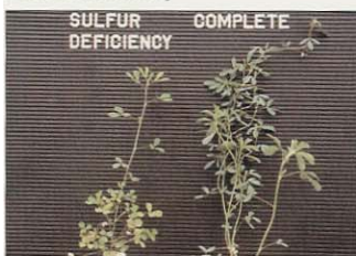
Stems are spindly with weak growth.