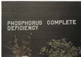
Deficient plants have blue-green leaves and stunted growth.