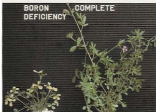
Deficient plants have yellowed leaves on shortened stems.