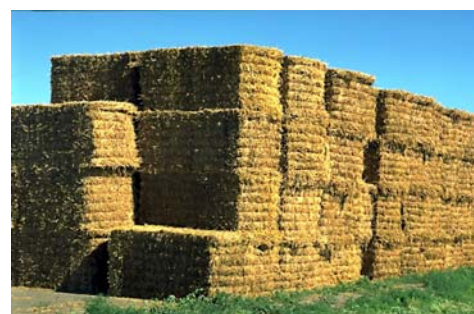
Get bales out of the field—allow regrowth in the field for next year's energy reserves.

Once hay is cut and baled, getting it out of the field quickly will also allow better regrowth of the field. It will also allow these plants previously under the swath to return more quickly to regular growth and to continue storing carbohydrate reserves for the winter. Simple maintenance of field hay and movement of bales out of growing fields as soon as possible can really help in fall management of fields and can insure better longevity of those alfalfa stands.